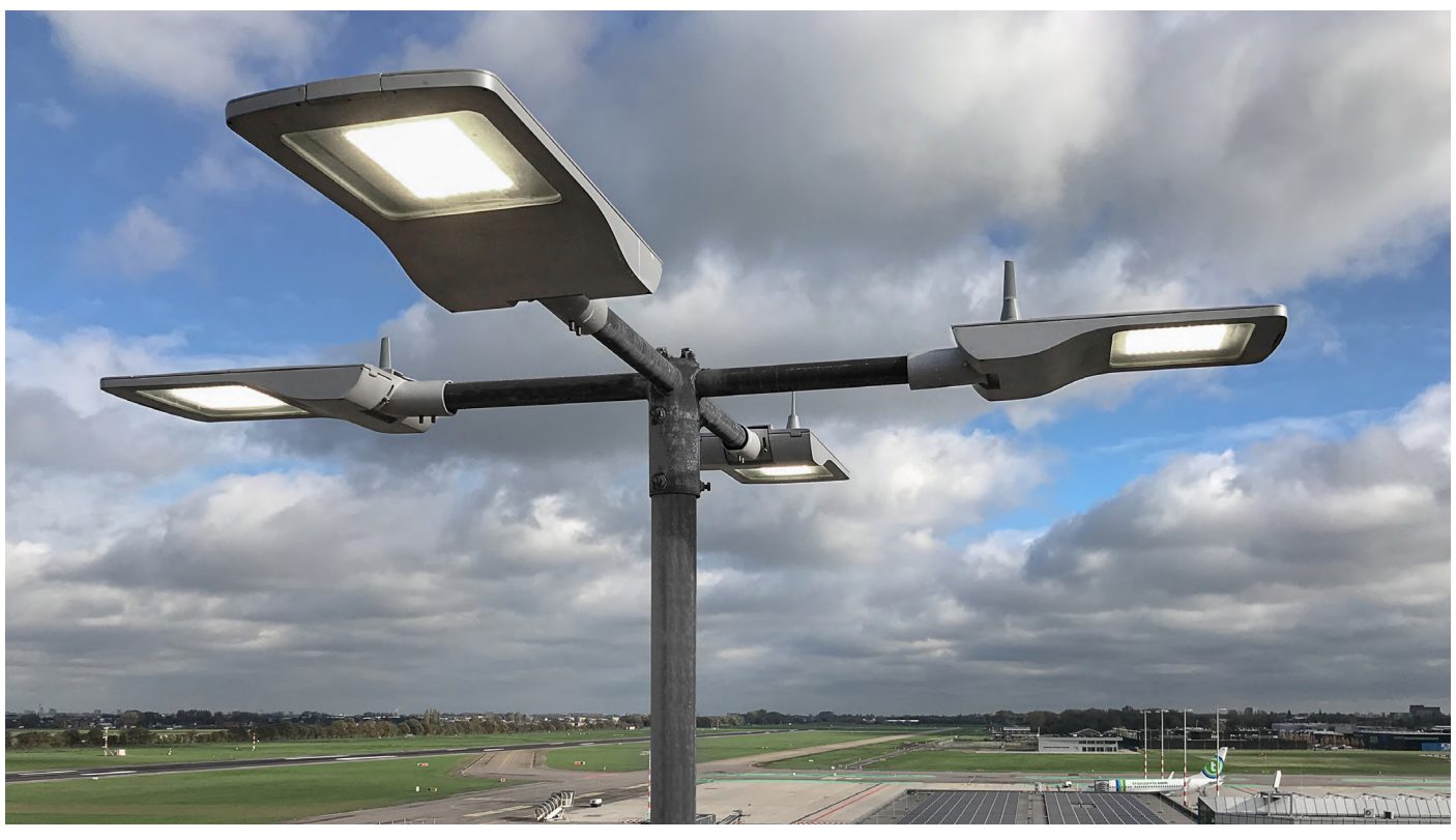
Product: Stork Little Brother