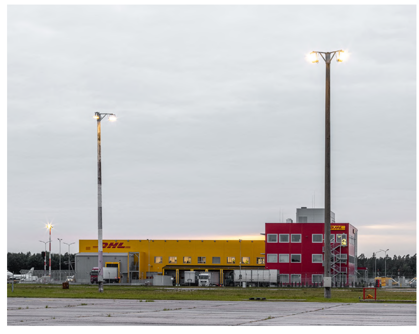
Products: Mustang, Owl, Stork little brother