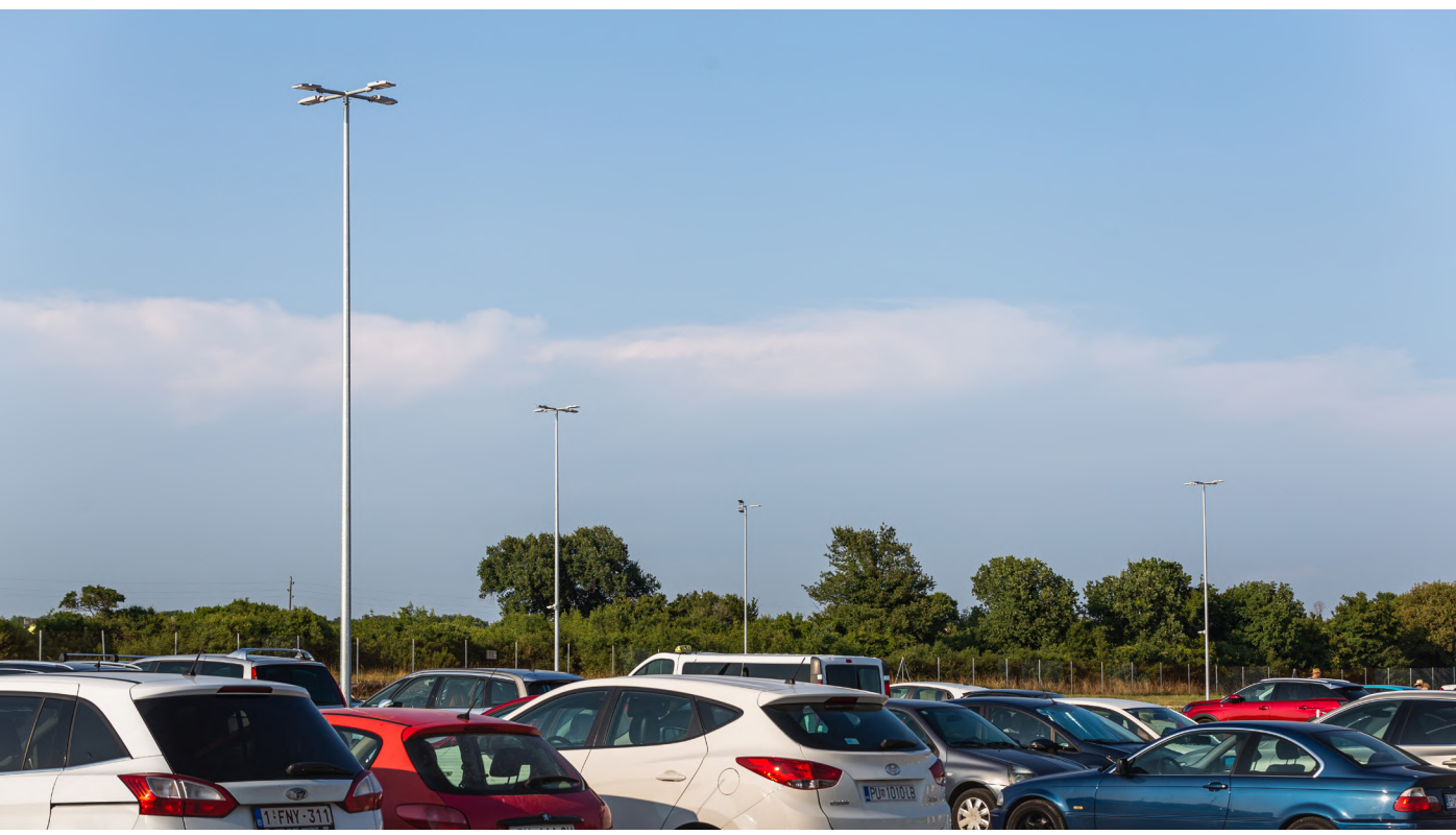
Product: Mini Martin