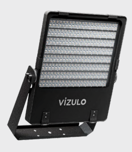
■ MUSTANG Up to 700 W Up to 90 540 lm