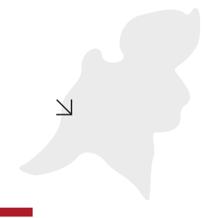
Rotterdam The Hague Airport Rotterdam, Netherlands