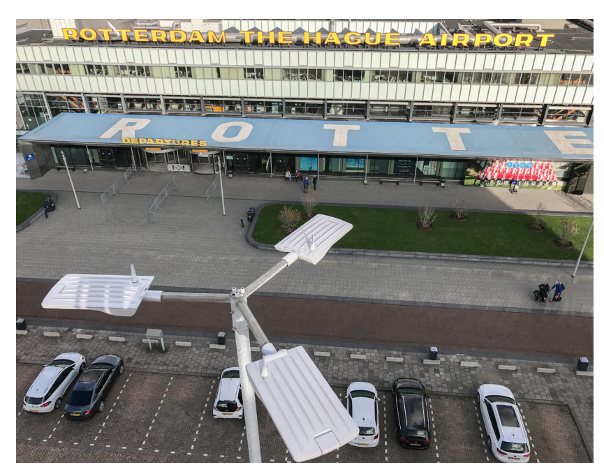
Product: Stork Little Brother