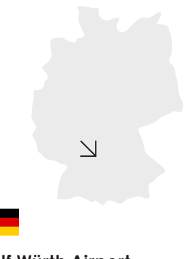
Adolf Würth Airport Schwäbisch Hall Schwäbisch Hall, Germany