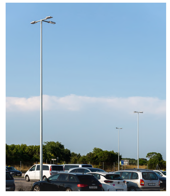
Product: Mini Martin