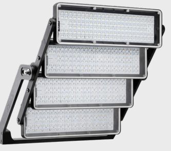
■ EAGLE Up to 2080 W Up to 281 771 Im